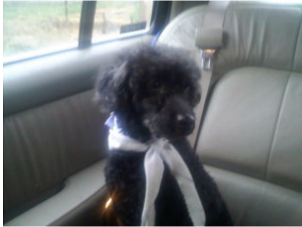
Moose - now Mario